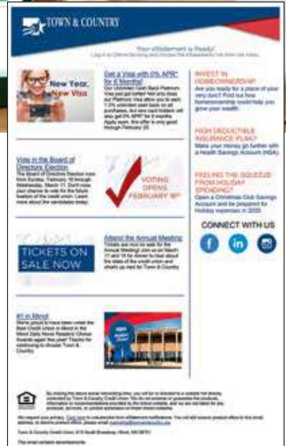
Custom E-mail Notification

Learn more at our upcoming webinar. Or, contact us online at lk-cs.com or call 866.552.7866 to speak with a sales representative today!