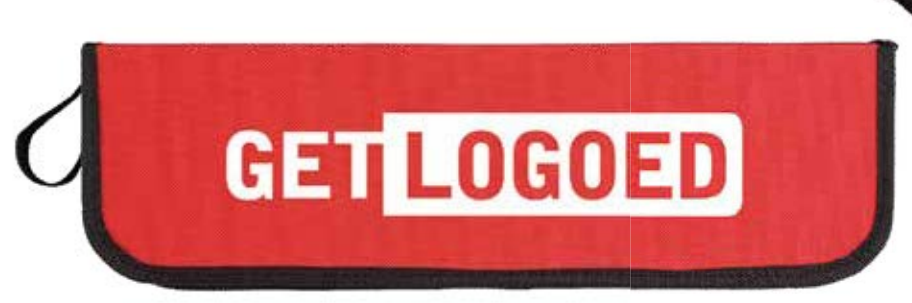
Matching zipper case, also available in blue and black.

Did you know? 81% of consumers keep promotional products for more than a year.